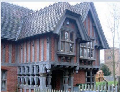
Prices exclude delivery and setup