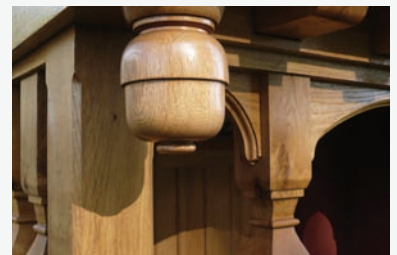
Solid oak porch, doors, windows and cladding

The dimensions listed are approximate. We cover all aspects of design and installation including issues such as planning permission, conservation area and listed building consents.